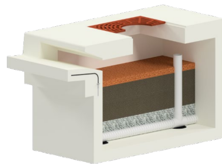
Tree Box Model with Curb Inlet