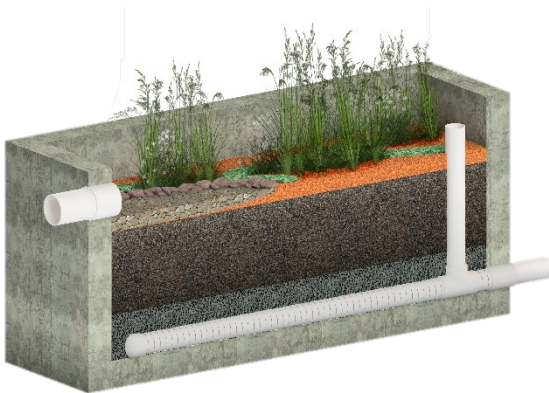
Planter Box Model

The following illustrations depict various possible deployment configuration models of the SVBF unit.